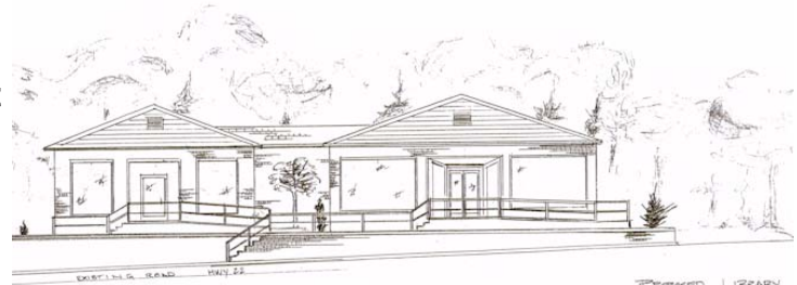
Elevation of a proposed home for the John W. Clark Public Library in a former bank building in Franklinville.