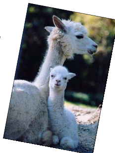
Caraway Alpacas at Archdale