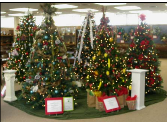
The 5th Classic Hospice Festival of Trees Tree lighting: 6:30 p.m. Friday, Nov. 16 Breakfast with Santa: 9:30 a.m. Saturday, Nov. 17 Breakfast with Santa: 9:30 a.m. Saturday, Dec. 1 Tour of Homes: 1-6 p.m. Sunday, Dec. 2

purchased at the library, the Randolph Arts Guild, Burge Flower Shop, the Collectors Antique Mall and the United Way Volunteer Center).