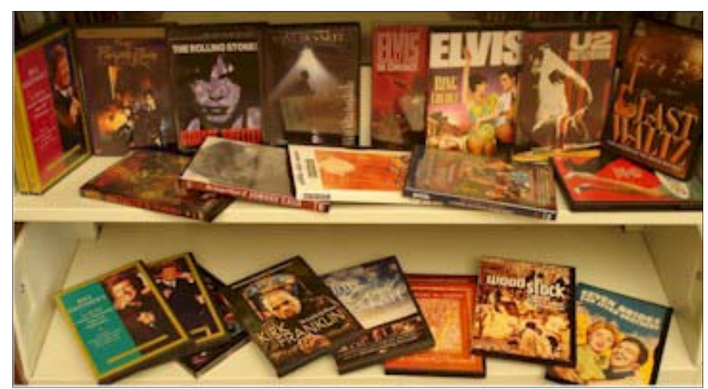
A gift from the Asheboro Public Library Foundation has enabled the library to purchase new music-related DVDs. The first batch has arrived— there are plenty more on the way.