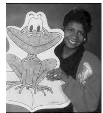
and Itty Bitty Frog

To register, come by the Children's Room or call 318-6804 by November 16. Children attending the breakfast must be accompanied by an adult.