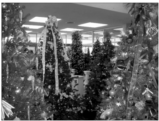
A Yule forest sparkles during last year's Festival of Trees.

The $15,611 LSTA grant is administered by the State Library, part of the Department of Cultural Resources.