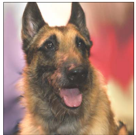
Rory, who played Sandy in RSVP's recent Annie, will set the standard at a doggy obedience class, 7 p.m. Thursday, September 17 at the Asheboro library.

Sponsored by the Friends of the Library, the event is free and all dogs' best friends are invited.