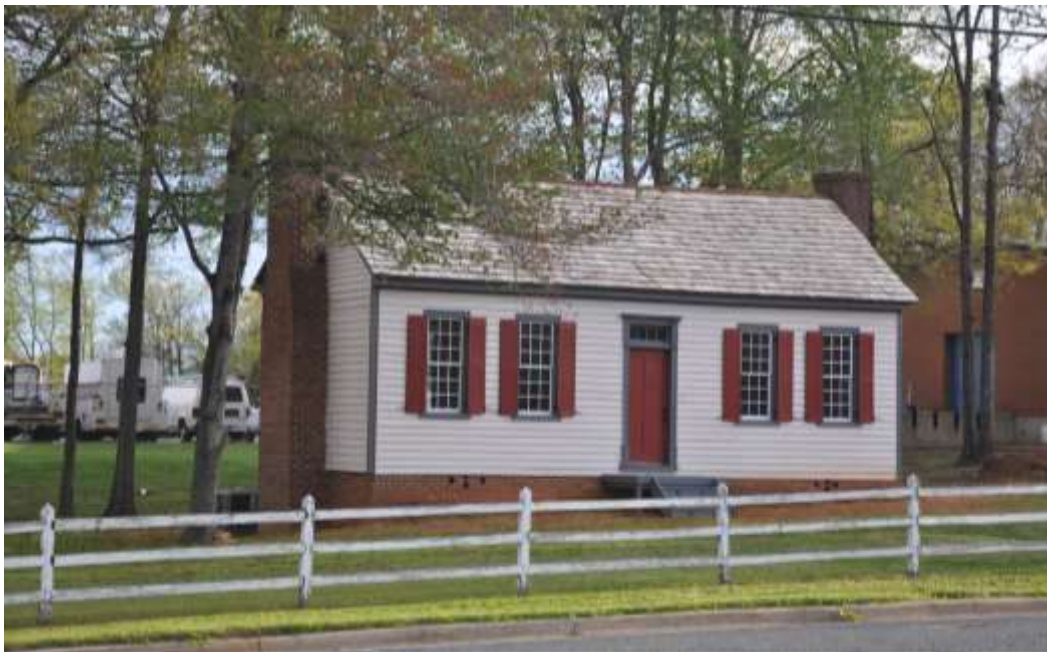
View from street showing rail fence put in place during 1976 restoration