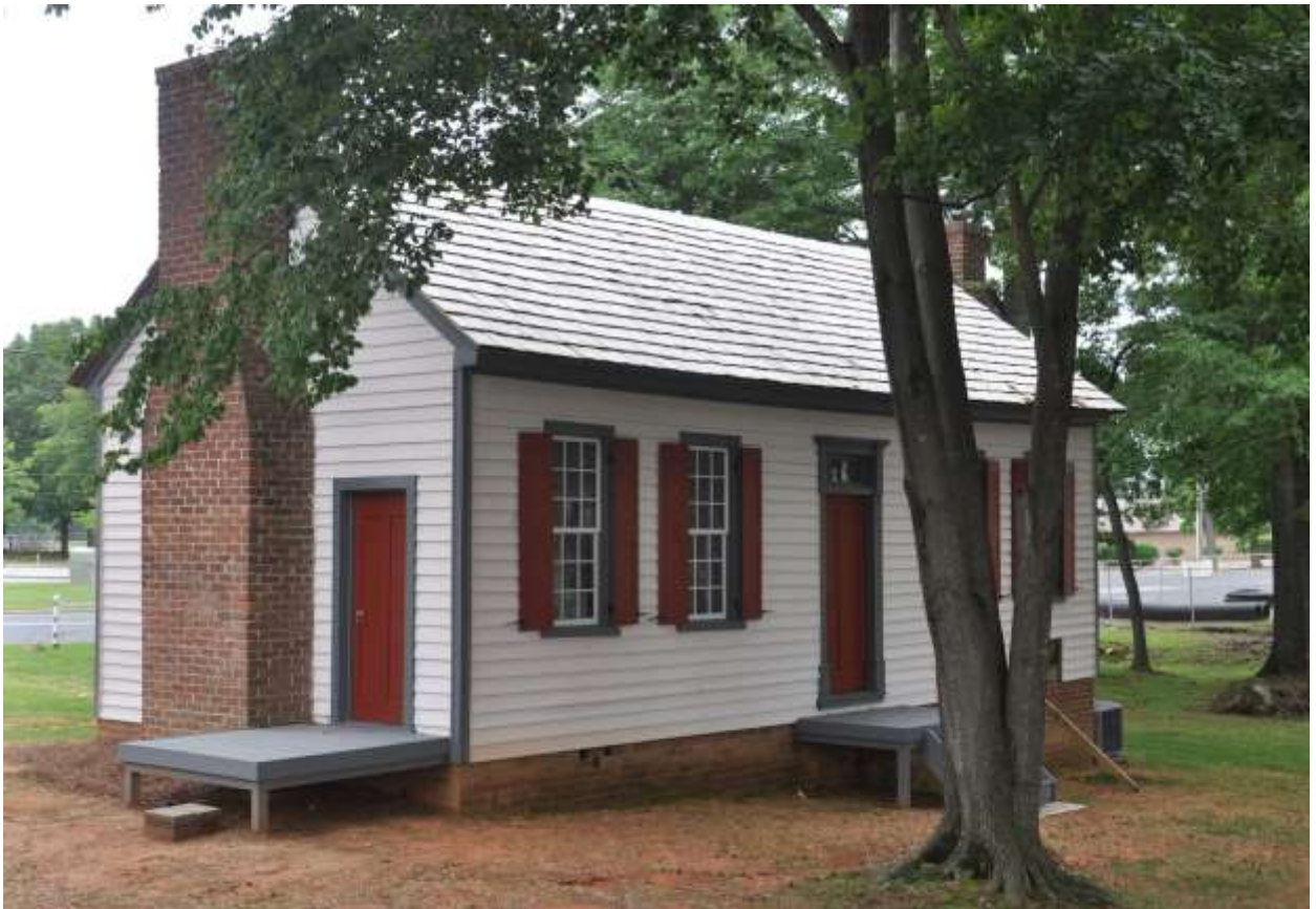
Northeast quarter facing interior of lot.