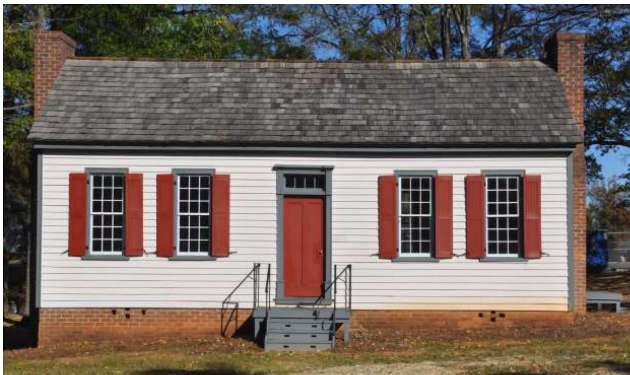
South front facing Walker Avenue.