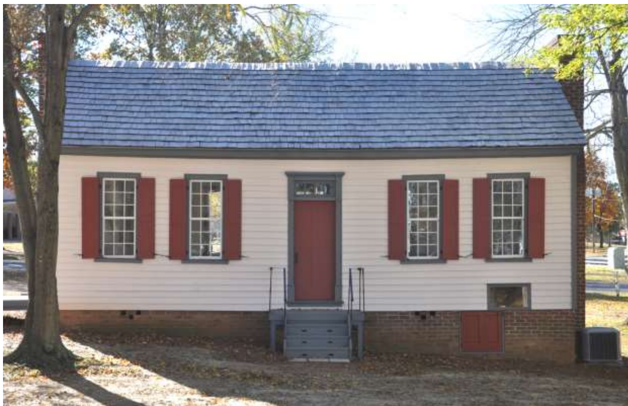
North front (window at right above foundation provides view of original post-and-beam construction)