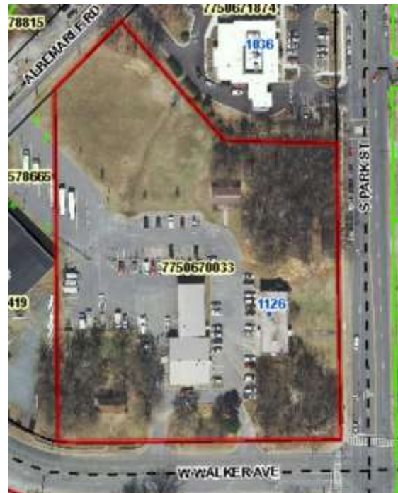
1126 S. Park St. full parcel