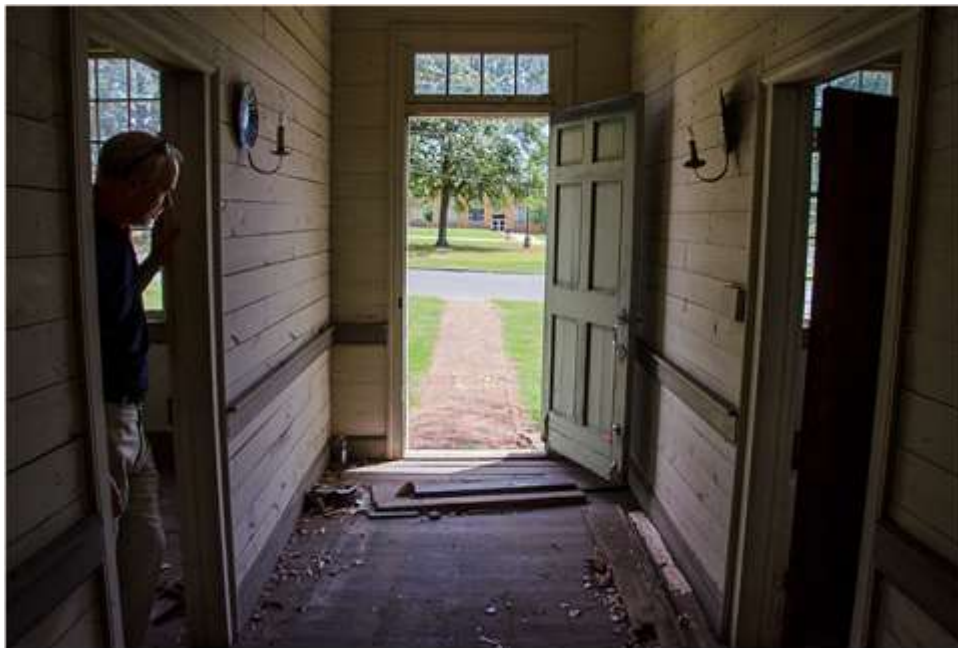
Central hallway looking south during restoration.