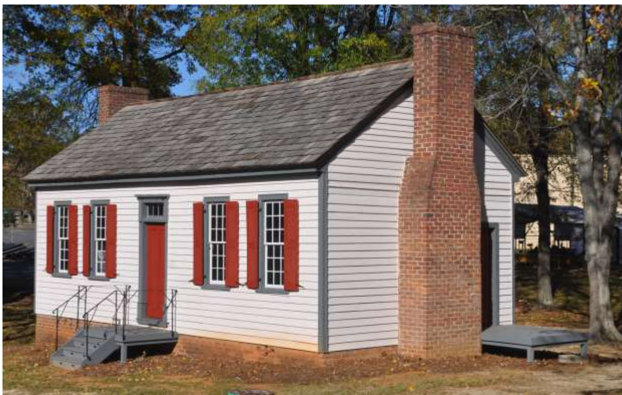
Southeast quarter facing Walker Avenue.