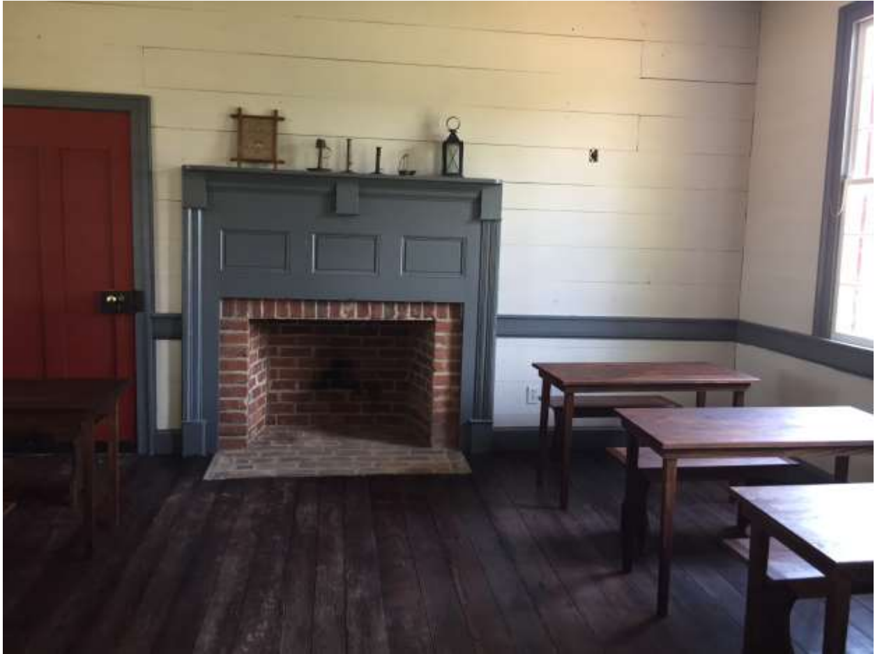
Interior view of east room showing original mantle and recreated period desks.