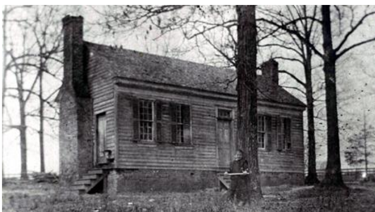
The earliest known photograph of the Asheboro Female Academy, probably circa 1890.

The construction history of the Asheboro Female Academy centers around three significant events. The first event is the initial construction of the building in 1839. The second event occurs over a century later with a restoration and change of location by the Randolph County Historical Society in the 1970s. The third is a historically-accurate restoration just completed by Trees NC in collaboration with the Asheboro City Schools.