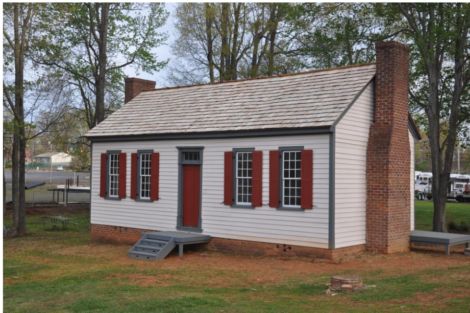
The Asheboro Female Academy as restored 2014-2017.