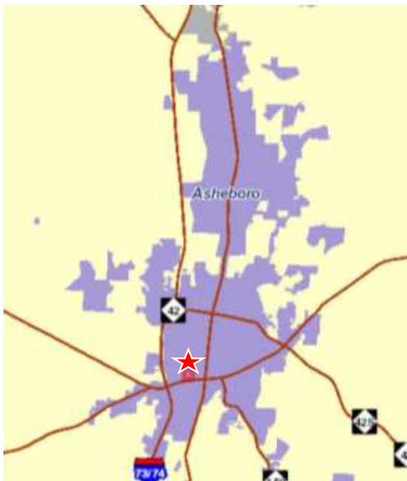
Approximate location in Asheboro