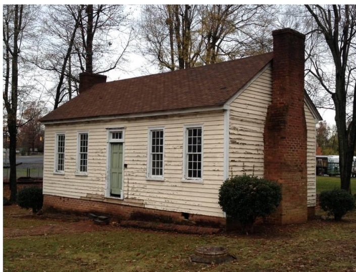
The 1976 restoration after a period of deterioration.

plywood sheathing before adding the new wood shingles. 123 Supposedly, the tin from the roof was salvaged but not used in any other part of the restoration. The Historical Society worked with local saw mills and painters to create reproduction window sashes, shutters, and weatherboard siding. The exterior restoration did not seek to remove old materials from the building, but to instead supplement the older materials with modern interpretations. For example, the original brick foundation of the structure was not removed, but new bricks were handmade by Old Carolina Brick Company of Salisbury, North Carolina to place alongside the original where they were needed. 124