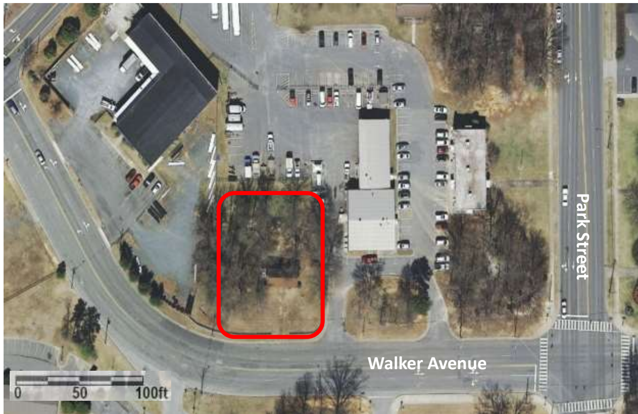
Proposed designation boundary