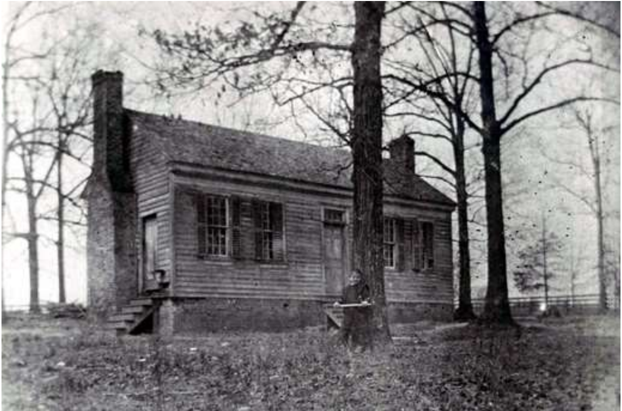
Oldest known Female Academy photograph, circa 1890.