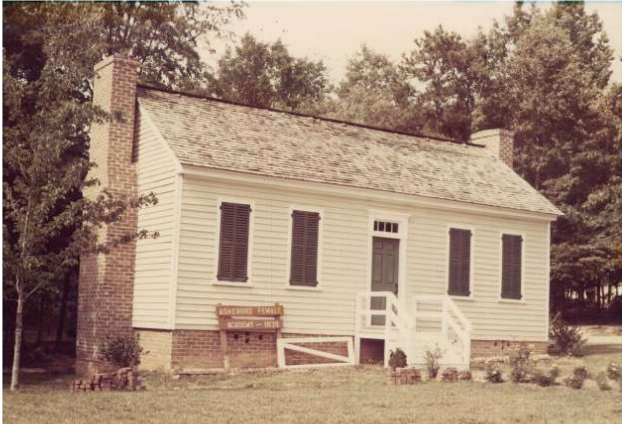
1976 renovation largely complete — sign leaning against building would be placed on southwest lawn