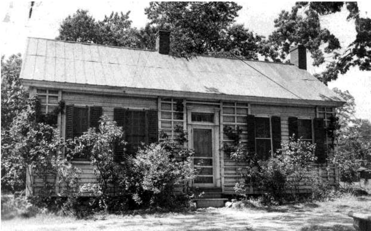
Female Academy building after conversion for storage or servant quarters by Armfield family.