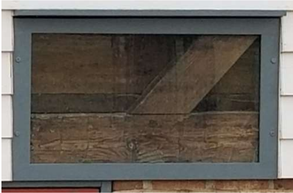
View window showing post-and-beam construction detail