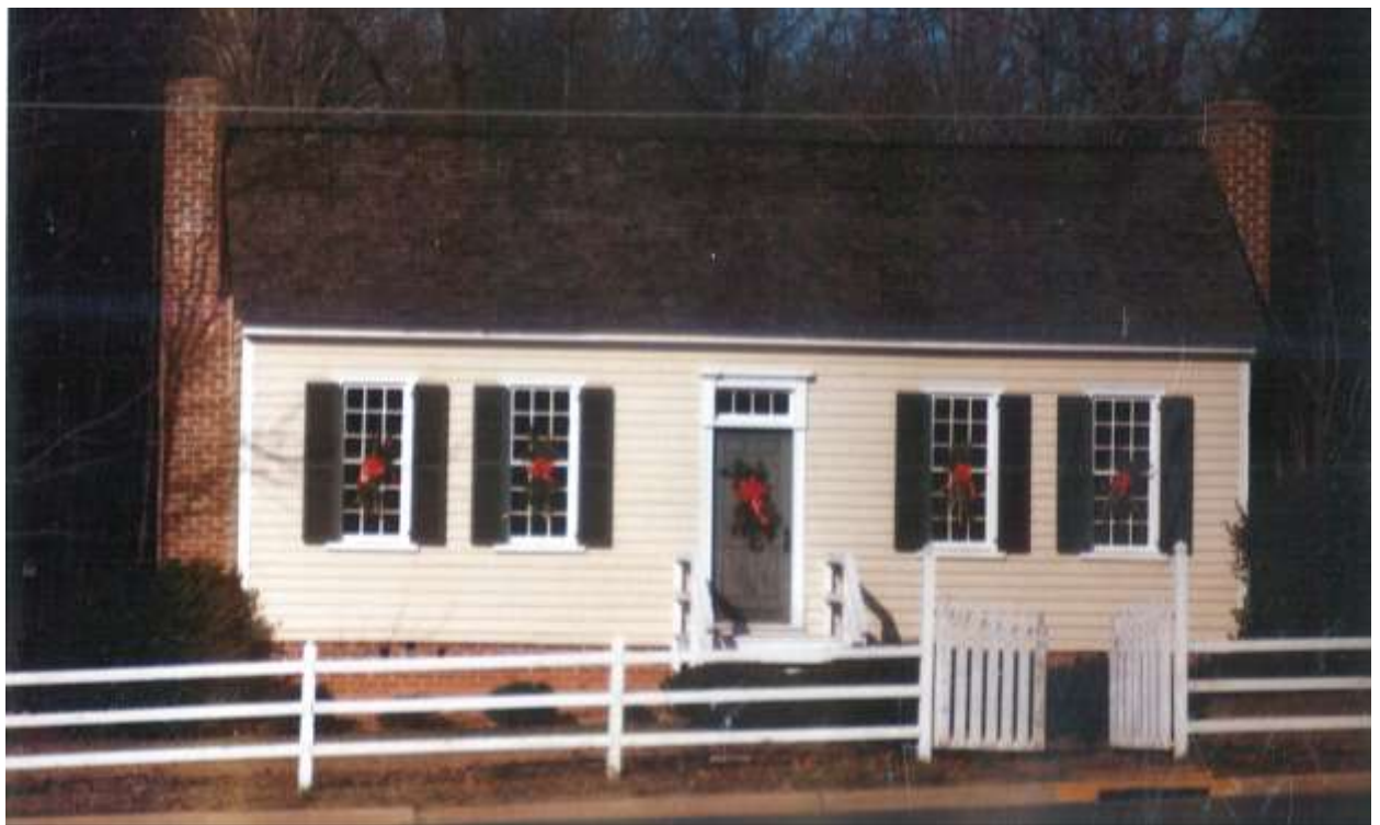
Decorated for the holiday season following the 1976 restoration