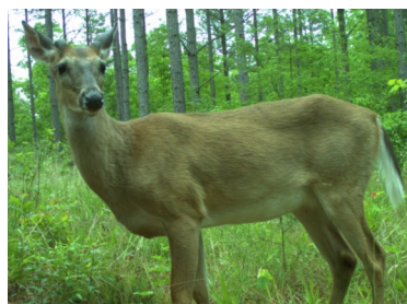
A deer captured with a Candid Critters camera in Randolph County in May.

♣ Wildlife cameras from the "North Carolina's Candid Critters" initiative have returned to the Randolph County Public Library and are again available for check out.