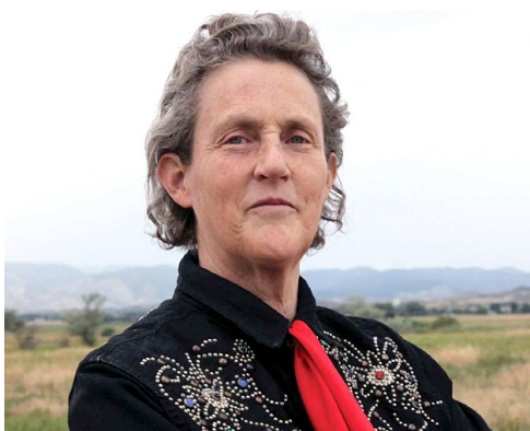
Dr. Temple Grandin

Her systems have been used with more than half of the cattle in the United States. Facilities designed by Grandin are located in the United States and countries across the globe. Her work hasn't stopped there. Today, at age 78, Grandin serves as a professor of animal science at Colorado State University. She has authored five New York Times best-selling books, and Time magazine named her one of the 100 Most Influential People in the World in 2010.