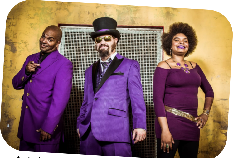
▲ In June. meet

Secret Agent 23 Skidoo, a Grammy-winning, internationally touring, purple velvet tuxedo-wearing family funk phenomenon as the Secret Agency hosts a virtual Rhyme Writing Workshop . Watch the workshop on the big screens at several libraries, or on your local library's Facebook page, then write your own rhymes. Can you write a rap to the beat and perform for the rest of your friends?