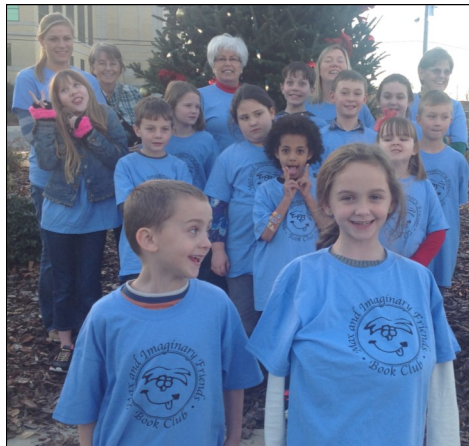
Asheboro Max and Imaginary Friends Book Club participants sport t-shirts featuring the imaginary character Max.