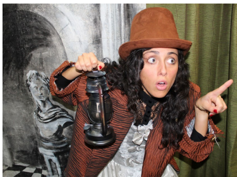
Bright Star presents "A Tell-Tale Tale."

pictures will be posted to Facebook and the Children's Room website on October 31.