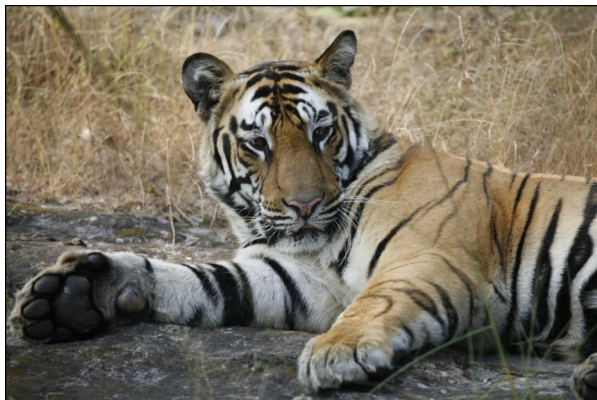
India's national parks provided N.C. Zoo Society travelers with several tiger sightings during a trip in April.

"A visit to India is full of noise, bustle and color and the amazing sight of cows, regarded as sacred, wandering through the streets, walking down the roads or just sitting in the middle of the road with the traffic streaming around them!"