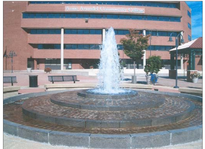
A fountain similar to one at Anne Arundel Community College in Maryland will grace the expanded Asheboro library parking lot.

Lighted flagpoles, tasteful landscaping and streetlights featuring seasonal banners and flower baskets will adorn the parking area. But the "pièce de resistance" is the