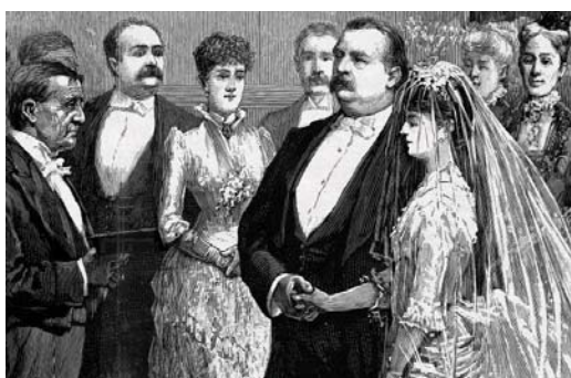
Frances "Frank" Folsom and President Grover Cleveland are married in a June, 1886, White House ceremony.

Frank is available from Barnes & Noble ( www.bn.com ) and Amazon.com.