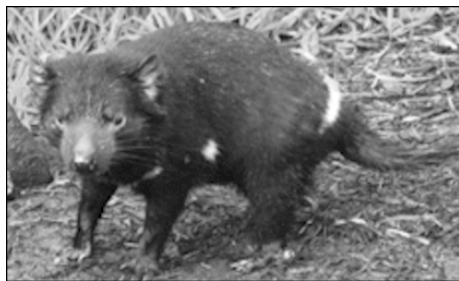
A Tasmanian devil — not something you see every day.

"Tasmania delighted us with wallabies and possums and we were able to see elusive Tasmanian devils and quolls in a wildlife breeding center.