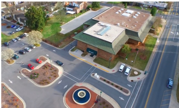
SkyHound takes an aerial look at the Asheboro library in a still from one of their videos.

Their slogan is “see beyond” because they love to give viewers a birds-eye view