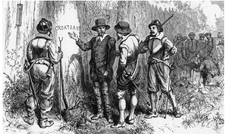
Sir Walter Raleigh's relief expedition, led by John White, finds the Roanoke colonists missing and the word "Croatoan" carved onto a stockade board.