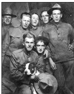
Members of Randolph County's Company K of the State Militia.

"More than 1,600 young men from Randolph County served in World War I, and more than two dozen of them gave their lives. The Randolph Room needs the evidence of their sacrifice so that future digital generations maintain a tangible link to our local history," says